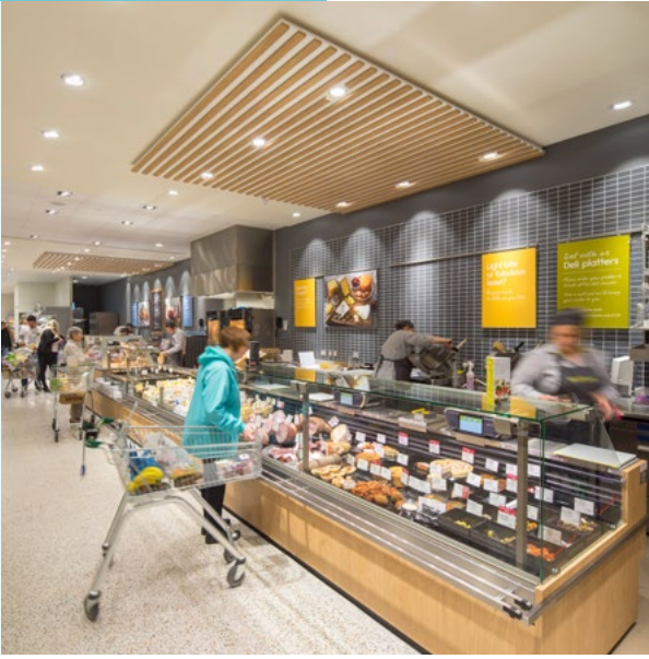
3.2m footfall p.a.